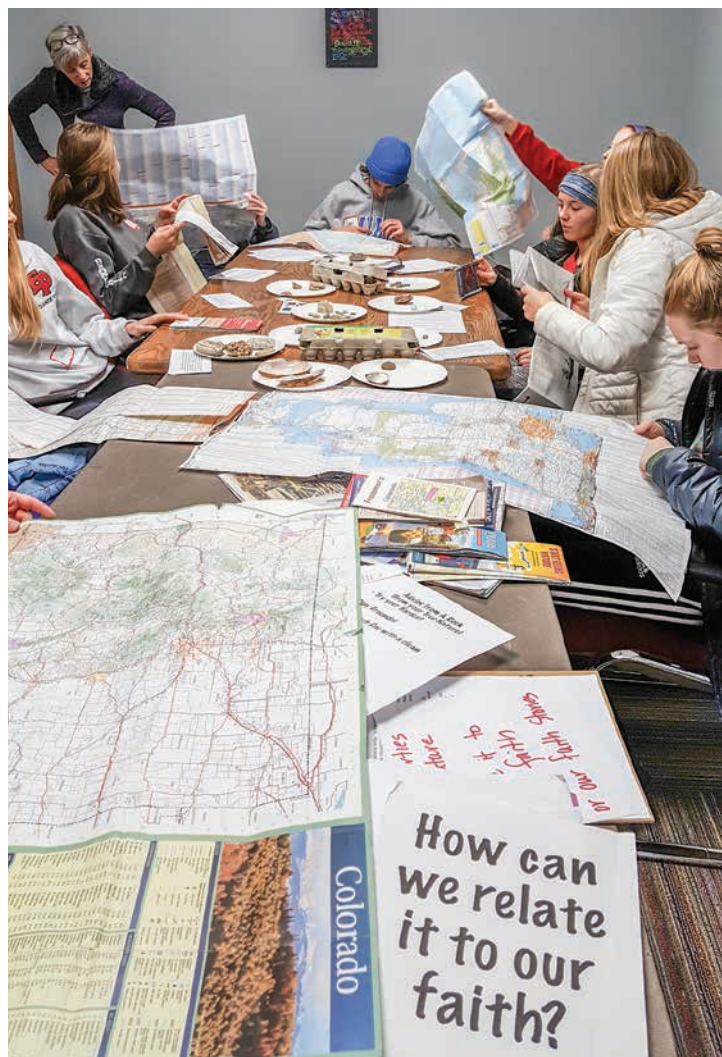
FIC youth participate in a hands-on activity with maps looking for towns named after saints.

“When we discuss seeds,” she says, “we ask the question: Who plants the seeds of faith in our lives? Do we plant seeds of faith in other people’s lives?” Then she says quite matter-of-factly, “Each little acorn is a huge oak tree.”