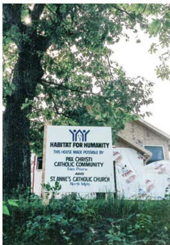
Pax Christi's ten year anniversary Habitat for Humanity project.

STRONG FAMILIES , strong neighborhoods, and lifelong learning begin at home, and Pax Christi will be contributing to helping build a dream for some hardworking local families by participating in the Habitat For Humanity Program. In honor of Pax Christi's 35th year anniversary, the Justice Council has been given a one-time gift of money to help fulfill Pax's mission of seeing the needs of society and to help solve the social injustices of the marginalized. In this Year of Mercy, we will be trying to help rectify the issue of