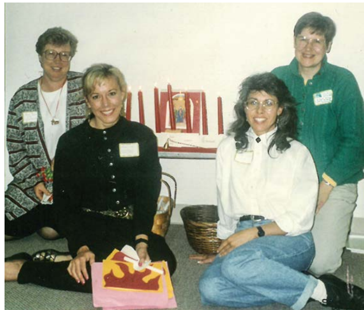
Good Shepherd founding catechists

DID OUR KIDS GET IT? Because CGS is based on the premise that children have everything they need inside them, versus a view of them as empty vessels that need to be filled, the CGS catechists guide the children to awe and wonder of God and God's gifts. This awe and wonder leads to a deep faith understanding and a deep sense of gratitude. The self-teaching principles of Maria Montessori appeal to the religious intuition of children. They come to 'Aha!' moments, and catechists are in awe. Some favorite memories they share with us: