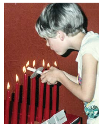
Pentecost - Gifts of the spirit.