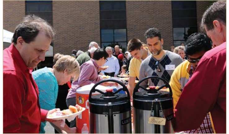
Everyone enjoyed hot dogs, chips, cookies, cake, ice cream, popcorn . . . and beautiful weather!