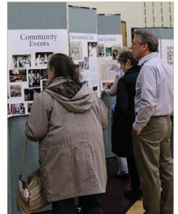
Photos and newspaper clippings from early years were on display.