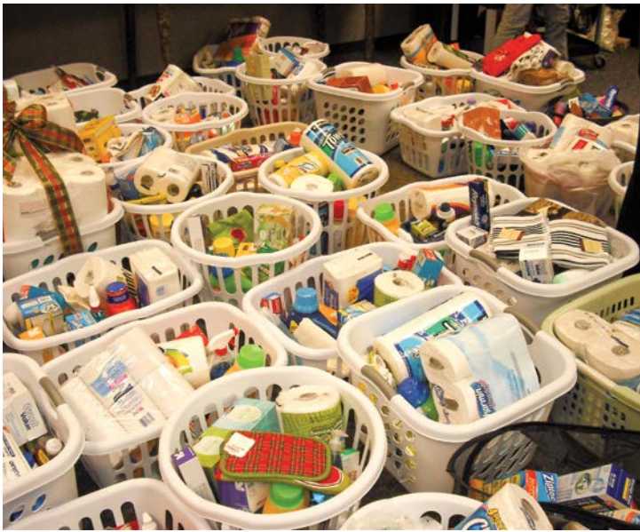
Share the Joy Christmas Drive