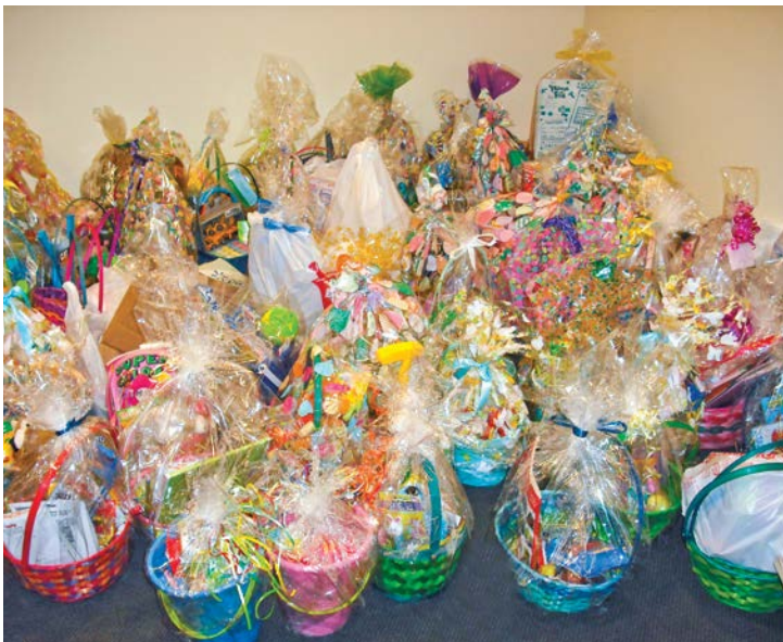
Easter Basket Drive