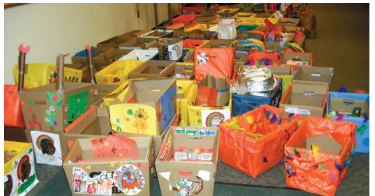
Thanksgiving Meal Drive

Our name comes from Luke 9:14-17. "For there were about five thousand men. And he said to his disciples, 'Make them sit down in groups of about fifty each.' They did so and made them all sit down. And taking the five loaves and the two fish he looked up to heaven, and blessed and broke them, and gave them to the disciples to set before the crowd. And all ate and were filled. What was left over was gathered up, twelve baskets of broken pieces."